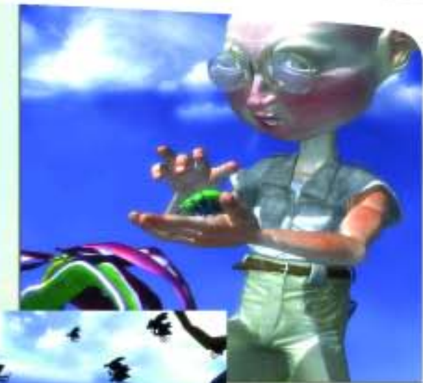
NVIDIA Timbury demo

Watching TV, DVDs, and high-definition video on a PC is quickly becoming commonplace amongst PC users. In addition to providing the horsepower and advanced features for an amazing gaming experience, the GeForce 6 Series GPUs also deliver unmatched video features and functionality through the industry's first on-chip video processor. This dedicated unit on the GPU handles the lion's share of the video processing load, freeing up the CPU for other tasks and improving overall system performance. The video processor delivers hardware-accelerated MPEG and WMV9 decode for smooth, artifact-free video, and high-quality video scaling and filtering for impeccable playback quality at any window size. Integrated HDTV-output allows you to connect your PC to a high-