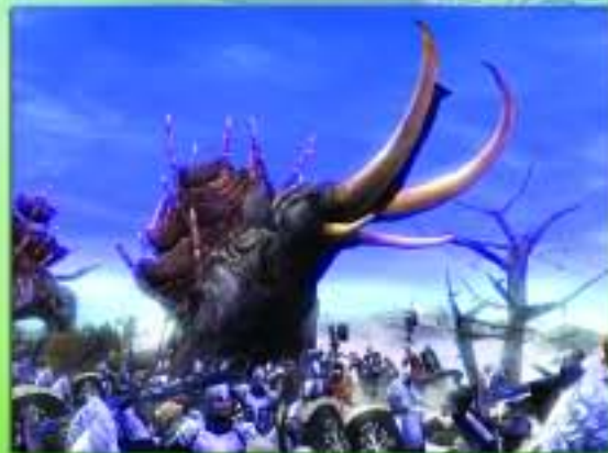
Lord of the Rings™: The Battle for Middle-earth ™/EA Games