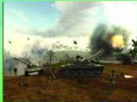
Battlefield Vietnam ™/EA Games

The GeForce 6 Series GPUs also feature the revolutionary new NVIDIA® SLI™ multi-GPU technology allowing you to combine two PCI Express®-based GeForce 6 Series GPUs in a single system to scale performance. Taking full advantage of the increased bandwidth of the PCI Express bus architecture—up to 8GB/sec. of raw graphics performance—NVIDIA SLI features an intelligent hardware and software solution that allows multiple GPUs to efficiently work together to deliver earth-shattering performance. With NVIDIA SLI, PC gaming will never be the same.