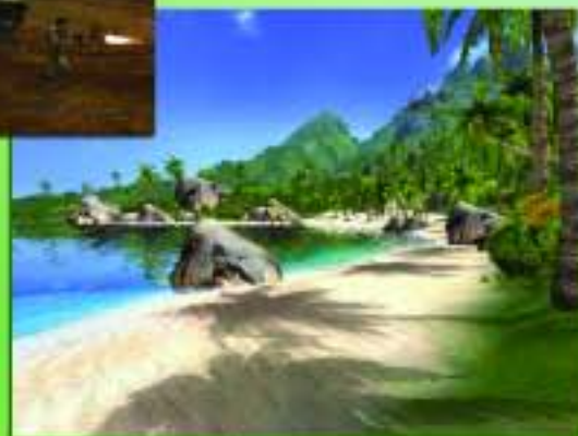
Far Cry ™/Ubisoft/Crytek